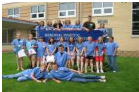
First graduating class of Club Scrub 2010!