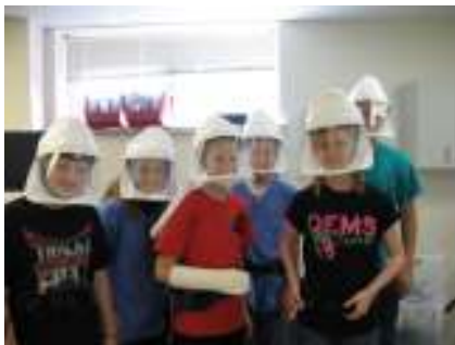
Club Scrub Students try on PAPR's during their April RT session

and how to check their blood sugar. 22 students were also presented a goody bag and a certificate of completion of the five month course. We congratulate and thank all the Club Scrub participants and their instructors for making our first program a great one! They may be our future healthcare workers. Great Job!