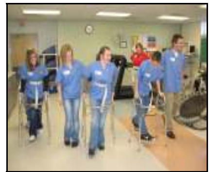
Pictured here are Darlington students learning more about physical therapy and the use of walkers.

ment, as well as tools to be used to assist individuals in dressing and eating. Surveys by the students showed that the Rehab Dept exceeded their expectations during their first session. Club Scrub is designed to introduce health care careers to middle school aged children by participating in hands-on projects. Our next Club Scrub session will be held in our Surgery Suite on February 24th.